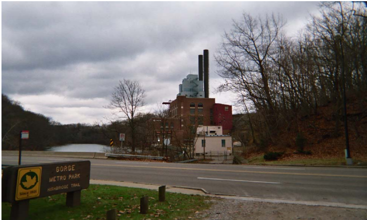
Photo 2: From entrance looking east across Front Street toward inactive power plant. December 4, 2004