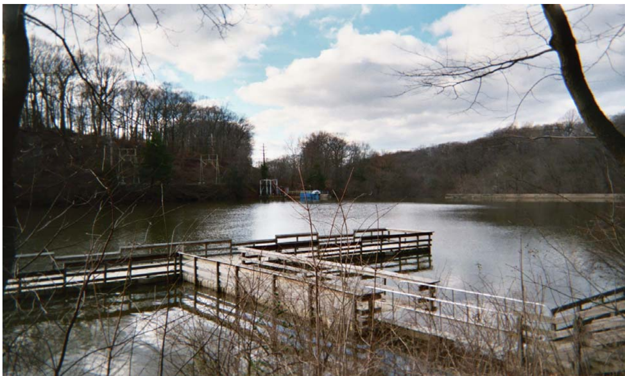
Photo 3: Impoundment looking from fishing pier toward dam. The blue structure with the white pipe arching over the dam is part of the experimental turbine that will be removed. December 4, 2004