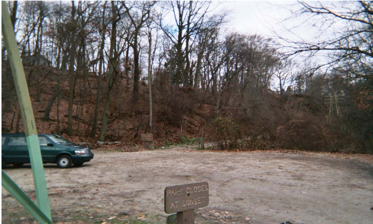
Photo 4: Park path entrance and trail to dam. The path was formerly a railroad. The transmission lines follow the path (note pylons). December 4, 2004.