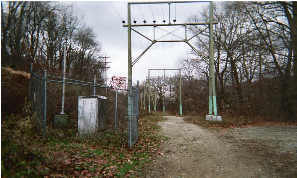
Photo 5: Path/transmission lines by dam. The fenced control box is for the combined sewer overflow. December 4, 2004.