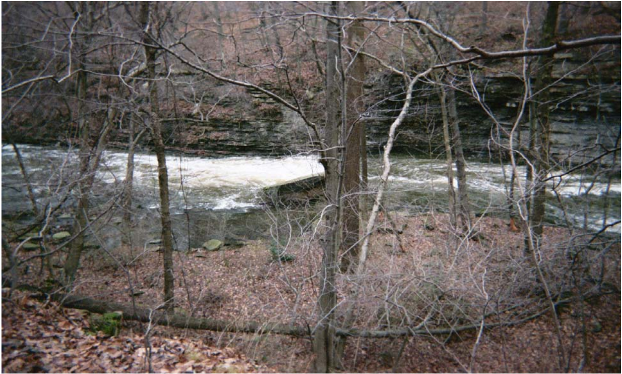
Photo 10: Approximate location of proposed powerhouse. View from south back looking across river to north. December 4, 2004.