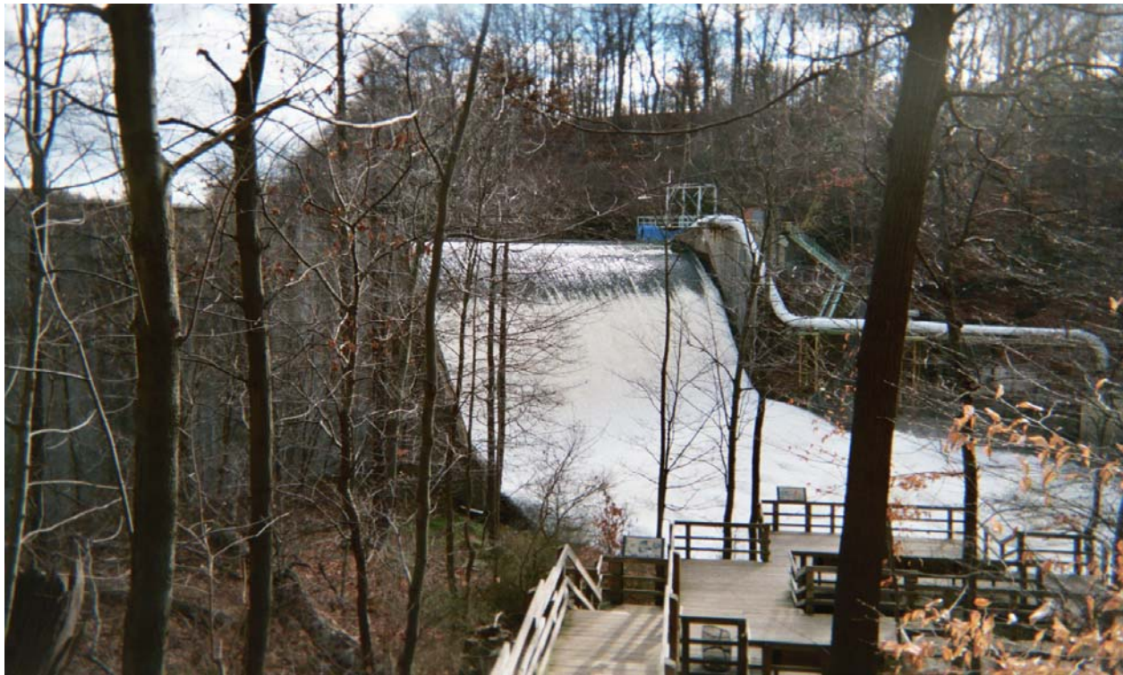
Photo 6: Dam viewed from north side. The wooden structure in the foreground is viewing platform in the park. The large white pipe is part of the experimental turbine that will be removed. December 4, 2004.