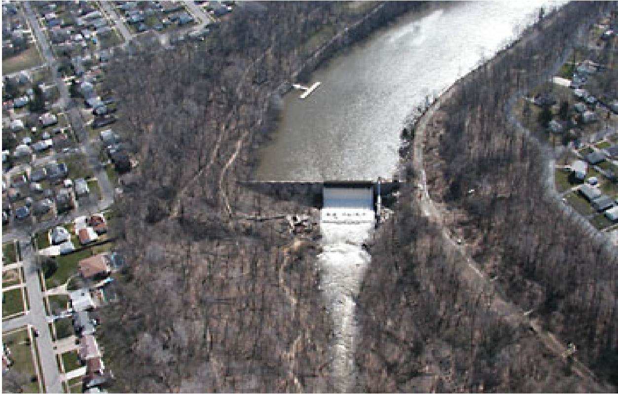
Photo 1: Ohio Edison Dam in Gorge MetroPark looking east. This photograph shows dense residential development on either side of the gorge. The main part of the park is on the left side of the photograph, including the fishing pier on the impoundment, trails, and a viewing area just downstream of the dam. The experimental turbine is the white pipe over the dam on the right side. The penstock cradles are the dashed feature on the right side of the photograph and downstream of the dam. The proposed power house will be located near the bottom of the photograph to the right of the river. The access road/trail are on the right side of the photograph. The transmission line pylons are visible along the access road.