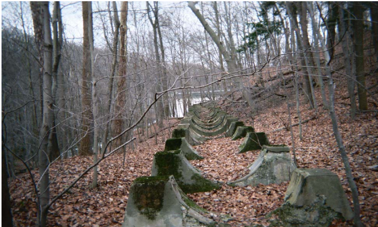
Photo 9: Penstock cradles that will be re-used. The dam is in the background. December 4, 2004.